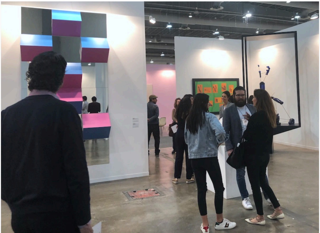
Zona Maco -Art Fair Mexico City