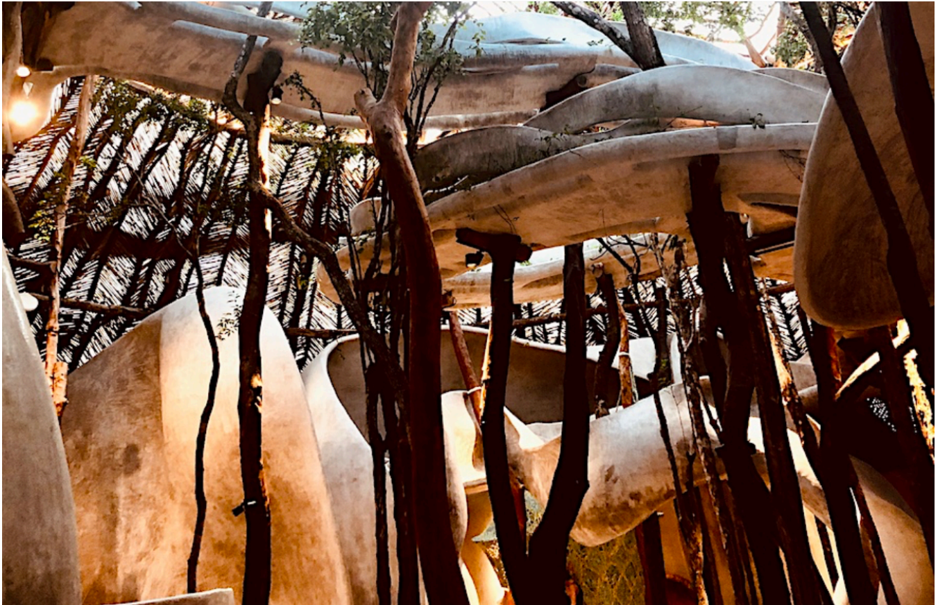
IK LAB Art Gallery Tulum